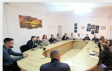
Prison of Jilava